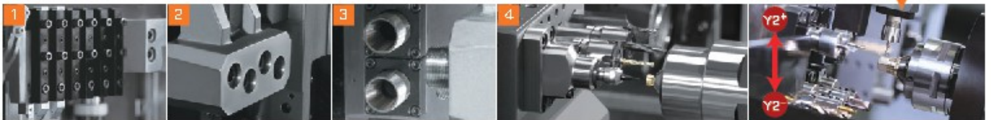
1 外徑刀座 O.D. Turning Tool

選配：背面選配 Y2 軸時可加選配立式鑽銑刀具刀座 Opt. Optional Radial drilling tool holder when Y2 axis is selected on the sub-spindle